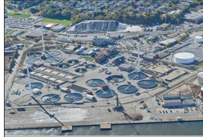
Field's Point Point